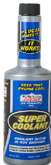
Lucas Super Coolant £9.99