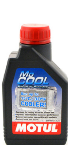
Motul Mo COOL £14.99