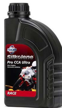
Pro CCA Ultra Anti corrosion use in cast-iron blocks. £11.50