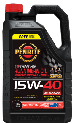
Running in oil (15w40)