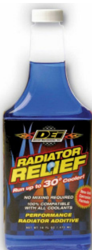
Dei Radiator Relief Reduces temp up to 30°. 472ml £11.50