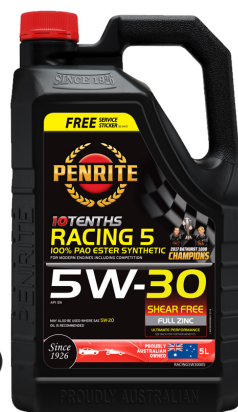
Racing 5 (15w30)