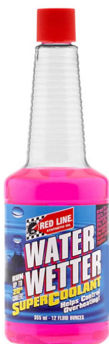
Redline Water Wetter The original cooling enhancer and corrosion inhibitor. Can reduce water temp by up to 20°. 355ml £12.90