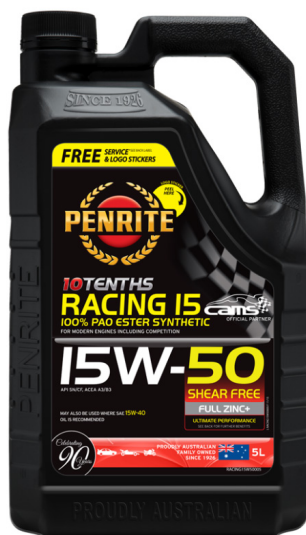
Racing 15 (15w50)