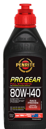
Synthetic (80w140) LSD Gear Oil