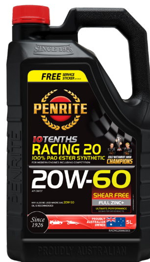
Racing 20 (20w60)