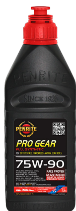
Synthetic (75w90) LSD Gear Oil