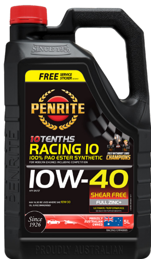
Racing 10 (10w40)